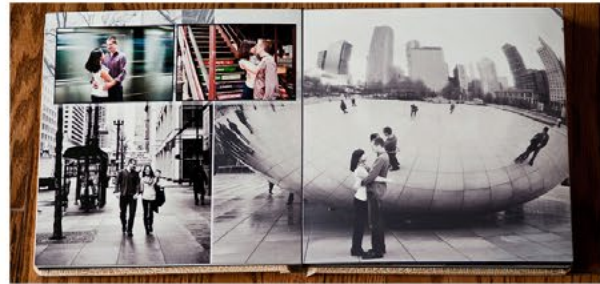
layflat pages - matte or metallic glossy photo pages