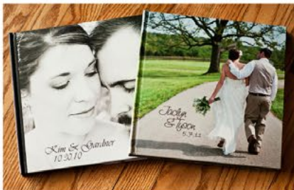
custom designed wrap around cover

8x8 - $185 • 10x10 - $260 • 12x12 - $360